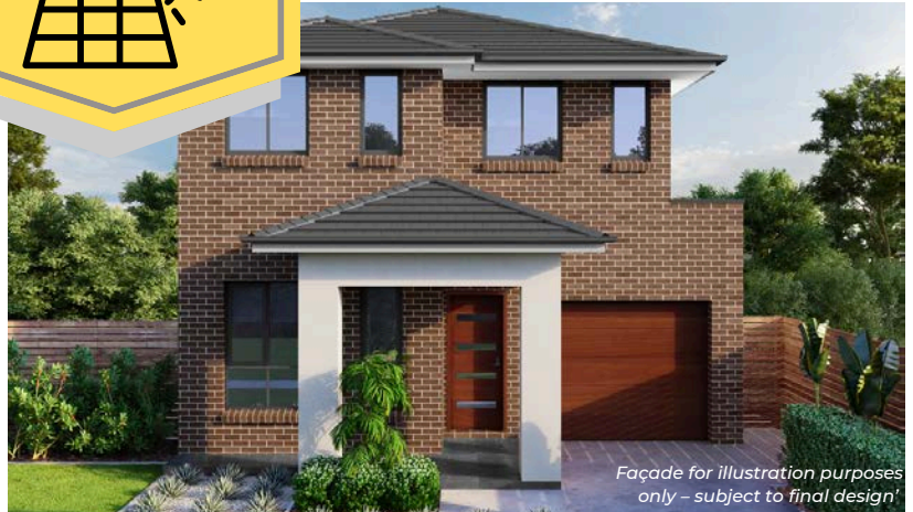
Facade for illustration purposes only - subject to final design!

CSB Homes foremost in quality since 1994 it's personal!